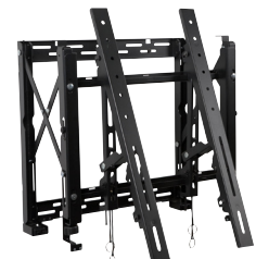
EYE-WHLCD-FS-QR-65-POR for Portrait Installation