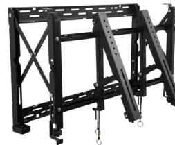
EYE-WHLCD-FS-QR-65-LAND for Landscape Installation